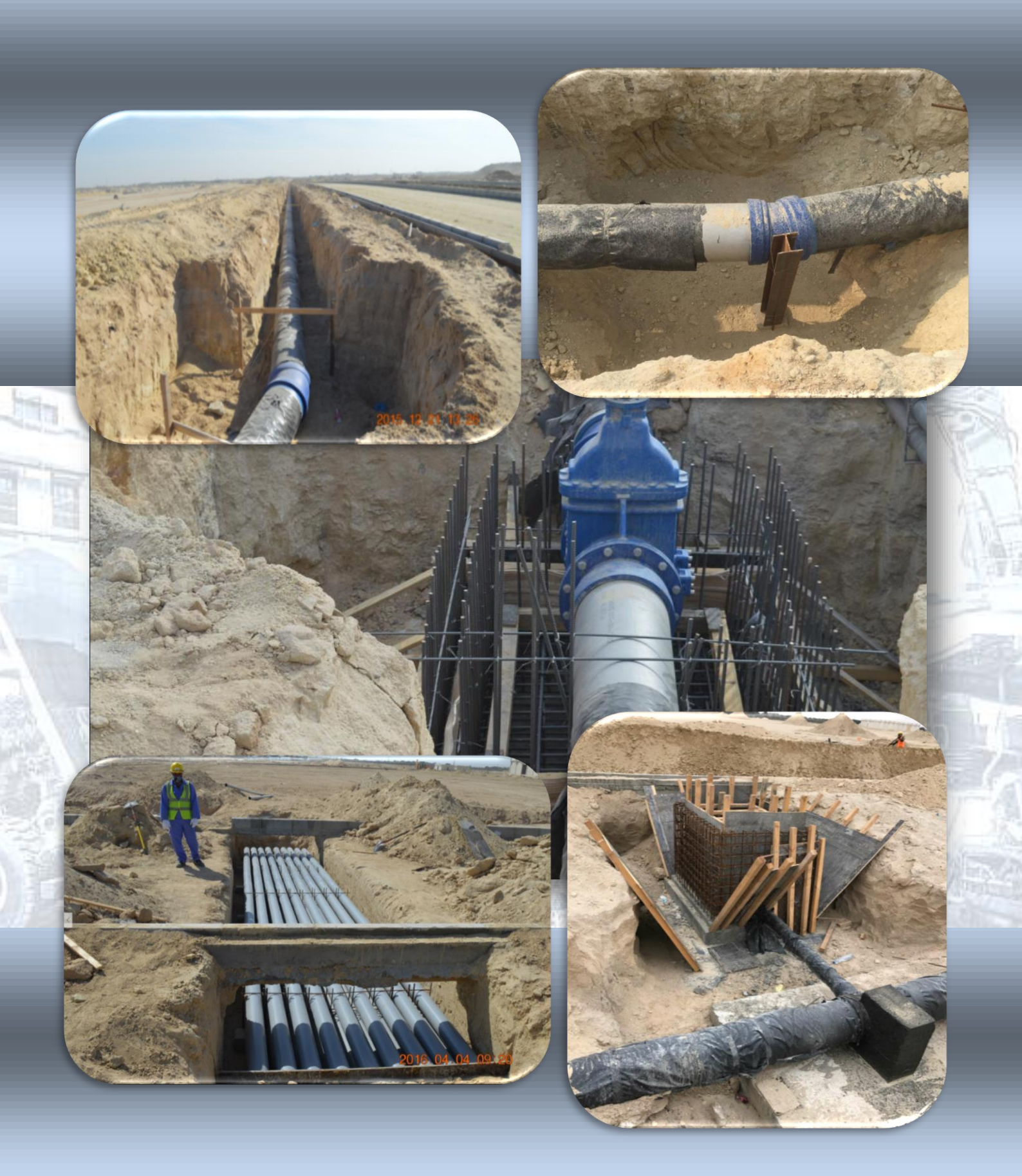
Water Supply, Electricity, Telecommunication Pipeline & Road Crossing